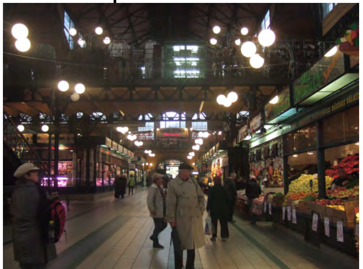
Above: The large market in central Budapest